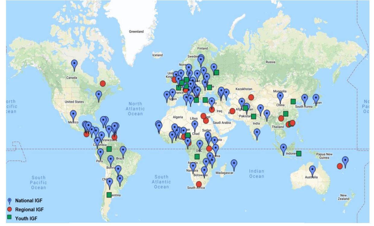
Geographical spread of the NRIs